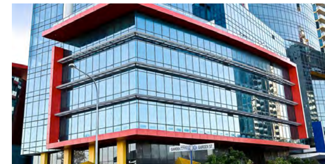
AGC Glass; Southport. AU (bears extreme ocean front salt spray)