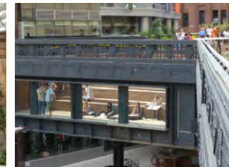
NYC Highline (bears extreme weather/pollution/high contact use)