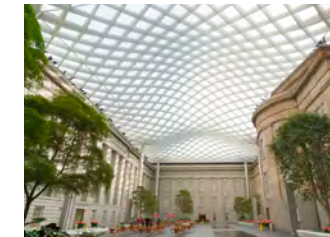
Smithsonian Institute D.C. (vulnerable horizontal glass)

Global Projects Treated with Invisible Shield®