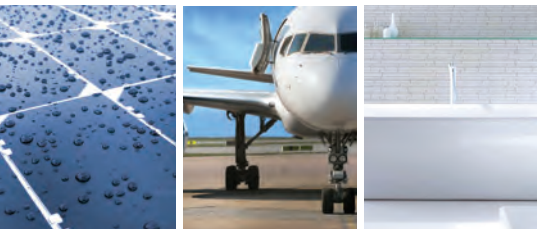
SOLAR AERONAUTICAL/AUTO VITREOUS CHINA/SANITARY WARE